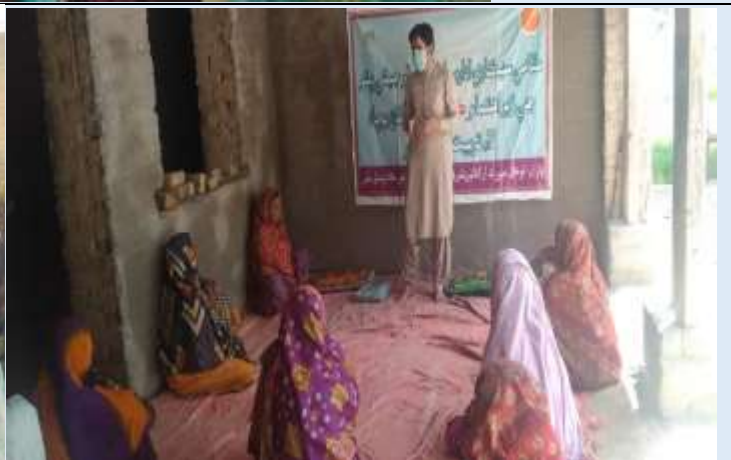
COVID-19 awareness sessions conducted by LSO Malir District Kashmore @ Kandhkot The End