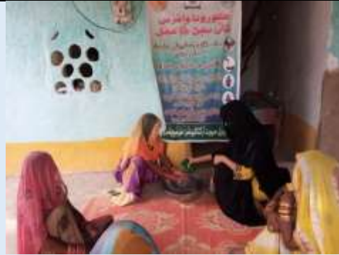
Hand-washing activity at Mirpurkhas