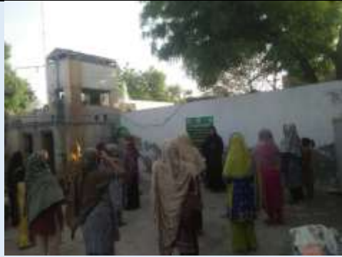
Social-distancing activity at Khairpur