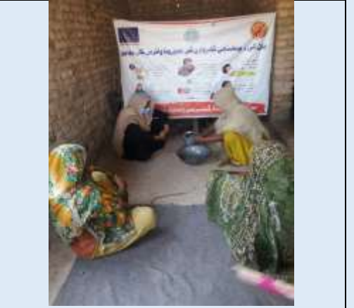
Hand Washing Actiivty under DFAPK at District Shikarpur