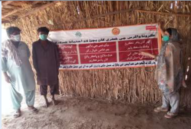
COVID-19 IEC Material/Banners were distributed at promiment places in District Shikarpur under HelpAge Project