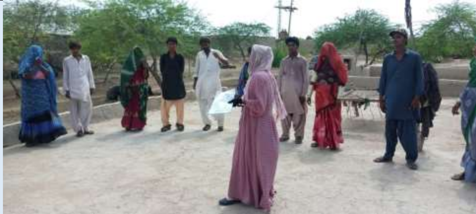
Social-distancing activity at District Mirpurkhas