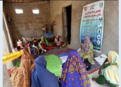
COVID-19 session at Mirpurkhas